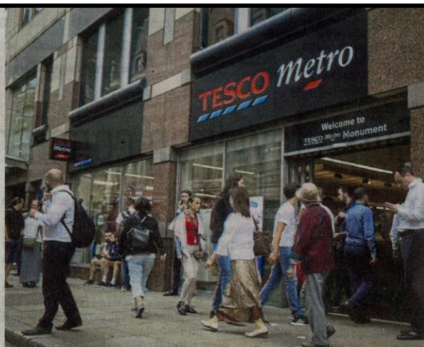
Tesco plans to remove the small plastic bags used to pack loose fruit, vegetables and bakery items and replace them with paper ones from its stores in the United Kingdom.

Tesco has told more than 1,500 suppliers that packaging will be key to deciding which products