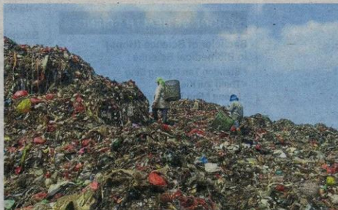
Irresponsible practice: Scavengers collecting trash at the Burangkeng landfill in Burangkeng, West Java. Around 500m from the site, residents found a mound of alleged imported waste.

The groups also reported that the 58 containers were re-exported from various importers in East Java,