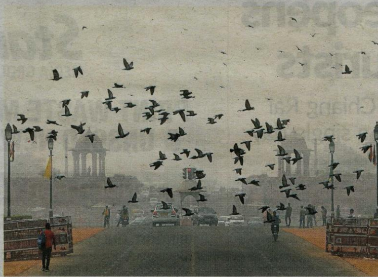
Haze hazard: Birds flying near India's Presidential Palace on a smoggy day in New Delhi.

The Environment Pollution Control Authority, which is leading the effort to tackle Delhi's pollution, said: "We have to take this as a public health emergency as air pollution is now hazardous and will have adverse health impacts on all, but particularly our children."